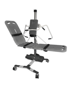
Integrated with the TR 9650 Mobile patient combilift the system provides a safe moving and handling for both patient and attendant. During the bathing cycle the client never leaves the comfort and security of the chair or stretcher.

The digital LED thermometer shows the shower and bathtub filling water temperature and the Autofill models also show the still water temperature in the bathtub.